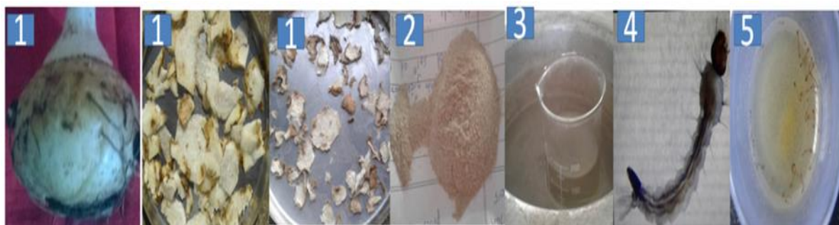
Figure 1 Photograph showing different stages in methods of extraction and application of corm powder extract

Arisaema murrayi (sapkanda) corm sundried for 3-5 days. Sundried corm grinded to make powder .5gm of powder mix in 200ml ethanol and boiled up to ethanol evaporate .After evaporation of ethanol residue was applied on mosquito larvae. After application of this extract larvae died within 4 hrs (Figure 1).